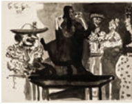
Hot Taco 200 East Bland a La danseuse sur la table from "Toros" The Dancers on the Table from "Toros" Pablo Picasso