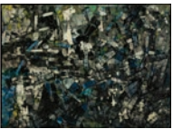
Tolley Museum 1507 Camden Rd Composition Jean-Paul Riopelle