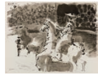
Pikes Soda Shop 1930 Camden Rd #2001 L'Entrée du Picador from "Toros" Pablo Picasso